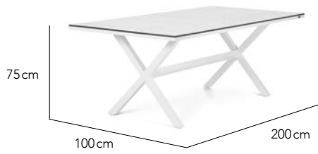
Dining Table 6 Seater HPCL Slats